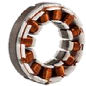
Motor stator coil

Unbalance DCR which happen on 3 phase motor may cause deflection on motor.