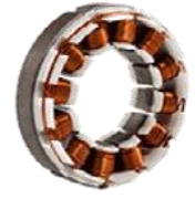
Motor stator coil

Unbalance DCR which happen on 3 phase motor may cause deflection on motor.